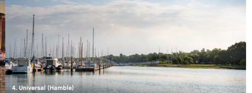
4. Universal (Hamble)