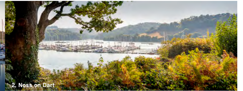
2. Noss on Dart