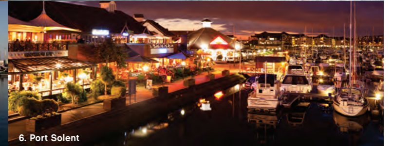
6. Port Solent